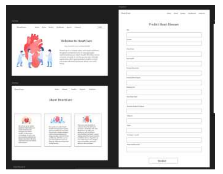
Fig. 5 Web application design for Heartcare

The final system evaluation measured the performance of both the model and the application using quantitative metrics, such as accuracy and qualitative user feedback. These evaluations led to iterative improvements in usability and accuracy. Thorough documentation was developed to support both end-users and developers, which will ensure clarity of understanding and support future updates.